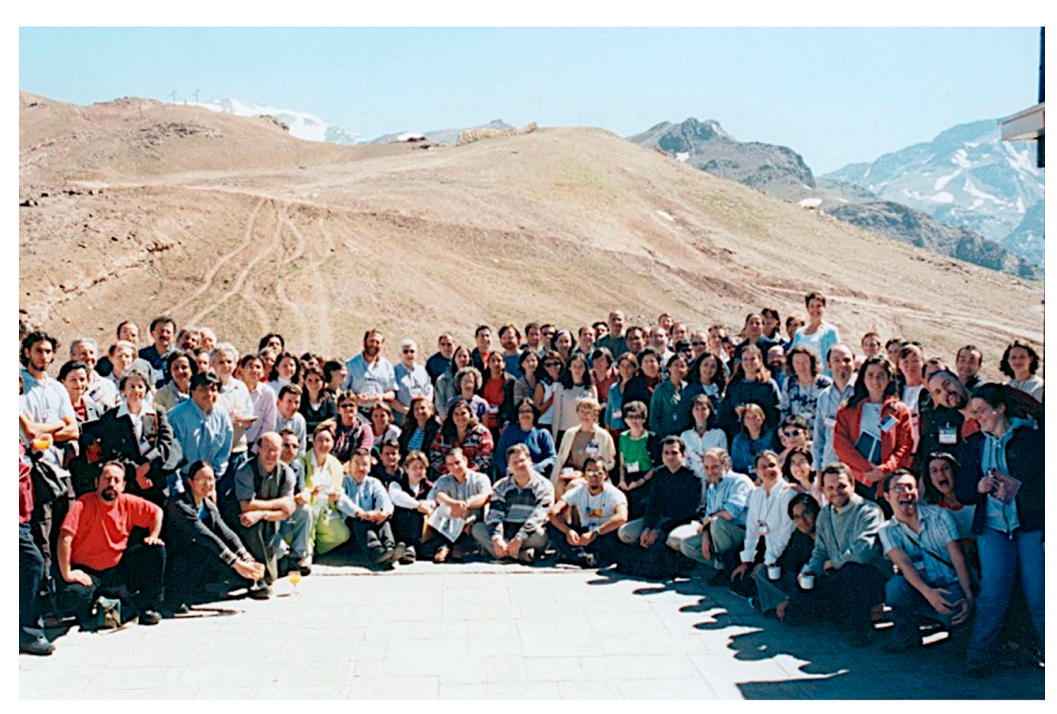
Fig. 2. Photograph of the participants at the first congress of the Latin American Society for Developmental Biology (LASDB, 2003). Several of the current members of the LASDB met at that congress for the first time.

confocal microscopy for the study of embryos of different organisms. The Leloir Institute houses good facilities for this type of course, and the course was successful. The conference began with an opening lecture by Eric Weischaus on the developmental pattern of gastrulation in Drosophila . This time, in addition to speakers from the United States and Europe, we had guests from Israel, such as Benny Shilo, and from Japan, such as Shigeo Hayashi, along with researchers from across Latin America. Many of the talks of this congress focused on different levels of development that practically covered all animal models from planaria to mammals through C. elegans , Drosophila , zebrafish, Xenopus , chick and mouse. Extraordinary presentations were also given on the development of organisms that are not classical models.