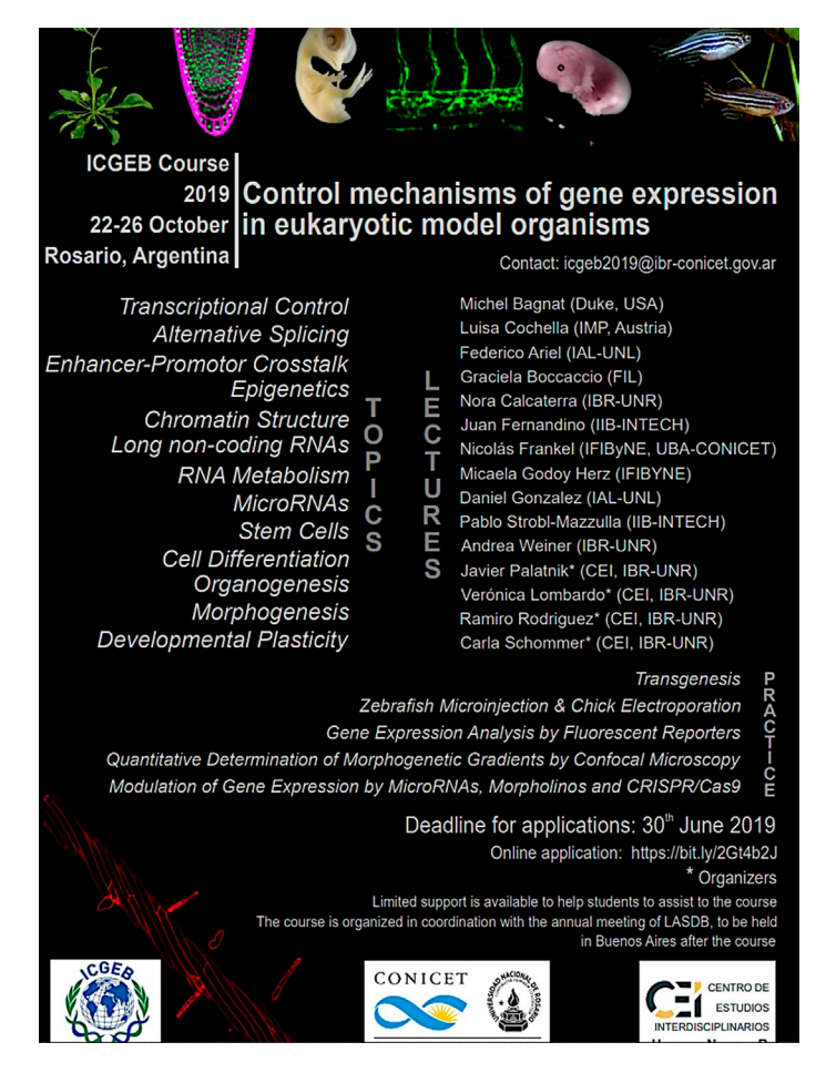
Fig. 4. Poster of the last satellite course of the Latin American Society for Developmental Biology (LASDB) congress in the city of Rosario, Argentina.

The eighth congress was held in the city of Santos, Brazil in October 2015. A satellite course on the comparative embryology